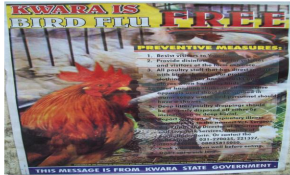
Plate I: A poster on Kwara is Bird Flu Free by Kwara State Government

The graphic and typographic elements in the poster are laden with syntactic uncertainty, which created a higher noise-to-signal ratio. The prime messages and particularly the supporting information are lost as a result of excessive variation of lines and haphazard placement of design elements. In addition, it is clumsy, wordy and illegible; which is aggravated by a showing-through-background. Also, it neglected the principles of organisation, particularly, Economy and Dominance in the way the elements of design are combined. So, the stimulus conditions necessary for proper perception of the graphic messages are inadequate and could be said to lack credibility for used as an IEC material to facilitate effective communication for development.