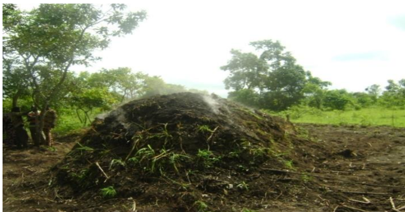
Fig. 3: A Kiln burning slowly

At the final process, the kiln is lit and left to burn slowly (fig. 3) for up to two weeks and at times four weeks depending on the type of trees cut. After this the charcoal is ready and all the sand and grass used to cover it are removed. Charcoal is then removed and bagged (fig 4) to be sold usually to the