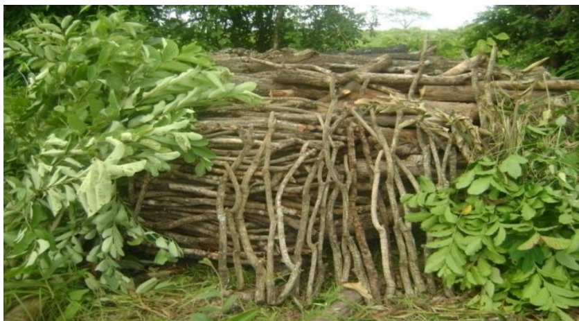
Fig. 2: Trees cut into woods stacked into a kiln