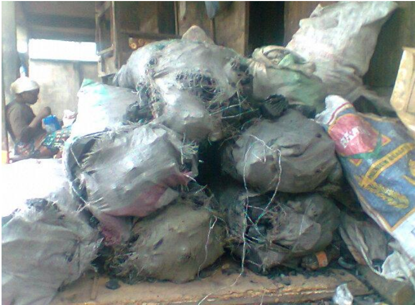
Fig 4: Charcoal packed in bags in Aboto-Oja

When asked whether the method of production has any impact on the health of the producers, most of the respondents 140 (93.3%) indicated that charcoal production has its health risks. For example fumes exuding from the carbonized wet-wood are poisonous as well as irritating to the eyes. Other health impacts include irritation such as difficulty in breathing, coughing, tearing in the eyes, fatigue and body aches. According to Anon, (2011), health challenges such as lung, blood oxygen absorption problem and cancer can be caused by smoke. Also, they experience burns when picking burnt charcoal and the heat emanating from most of the kilns when picking burnt charcoal is over 1,000°F with little smoke just what was needed for metal work (Harris, 2012). This equally affects the environment by making the temperature to be very high when compared with other environment where charcoal is not being produced.